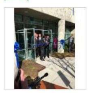
Ribbon cutting actual.jpg